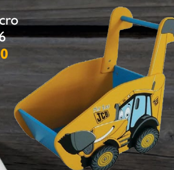
Kids - Push Along (JCB1721) - £40.00