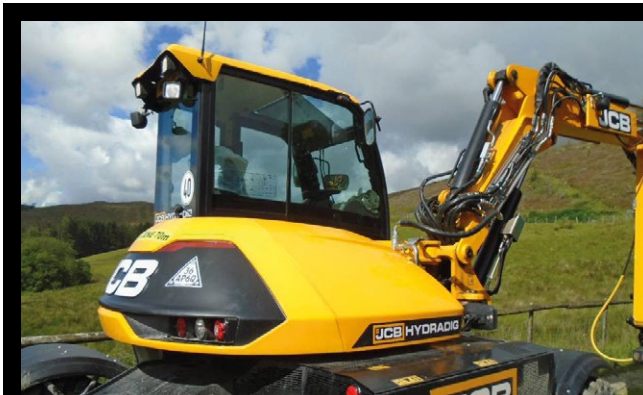
2016 JCB Hydradig 110W Wheeled Excavator

JCB Hydraulic quick hitch, 1,500 hour service kit, LiveLink on machine cost. 1,283 hours of use.