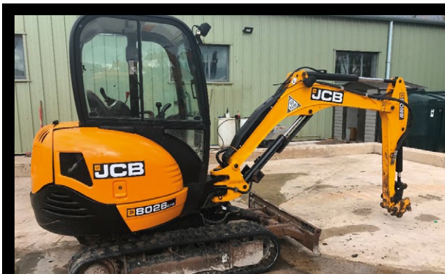
2013 JCB 8026 CTS Mini Excavator