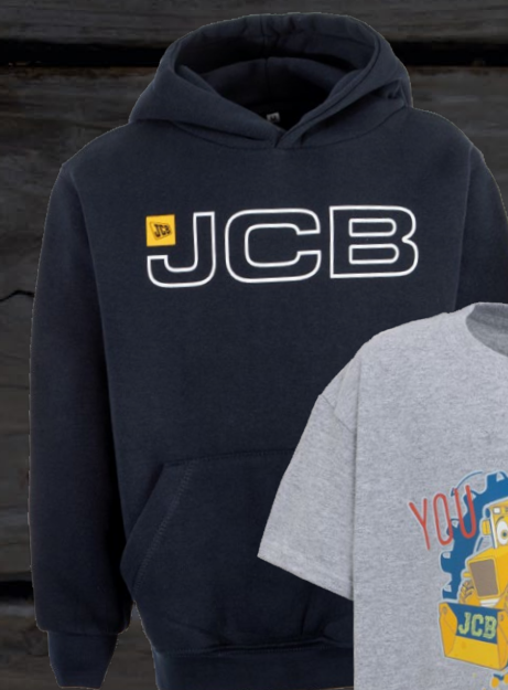
Kids Navy Hoody (JCB2086) - £19.00