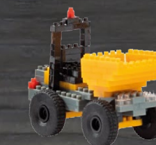
JCB Site Dumper 3D micro brick construction set. 126 Bricks (JCB2119) - £10.00