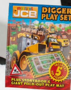
Play Book 2 JCB - Digger Play Set (JCB2063) - £11.00

CONTACT YOUR NEAREST GUNN JCB DEPOT TO PLACE AN ORDER