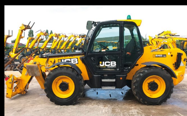
2017 JCB 540-140 Hi-Viz Telescopic Handler