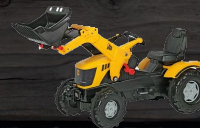
Kids - Tractor ride on - Fastrac Tractor with front scoop (JCB1217) - £229.99

LOOKING FOR PRESENT IDEAS FOR THE CHILDREN THIS CHRISTMAS?