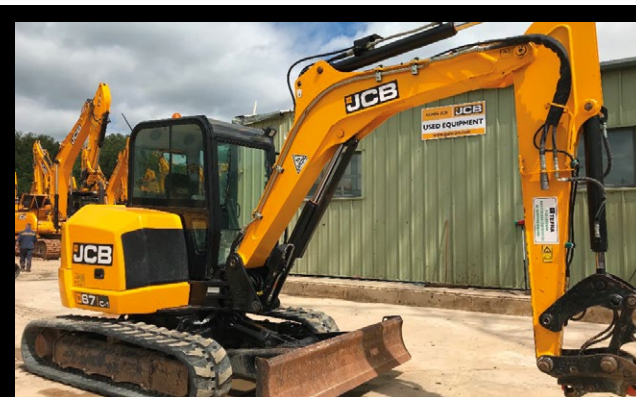
2015 JCB 67C-I Mini Excavator