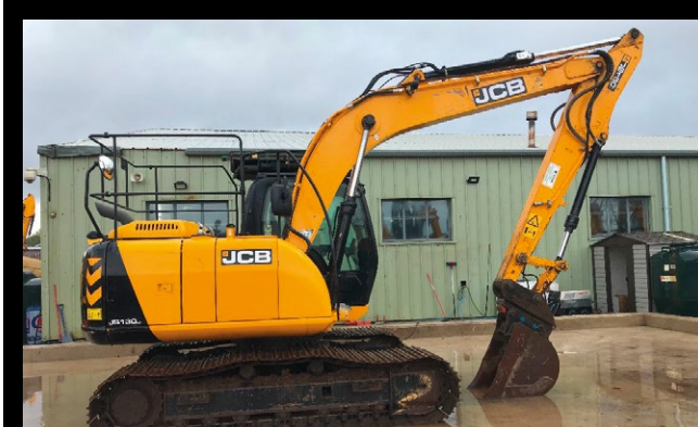
2015 JCB JS130LC Crawler Excavator

Very tidy JS130LC, quick hitch, hammer pipework. 5,500 hours of use.