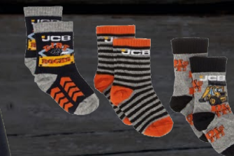
Kids - 3Pk Boys Dig It Socks (JCB1838) - £6.99