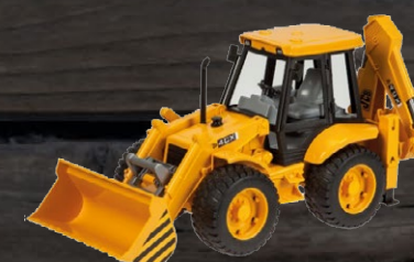
4CX Backhoe Loader 1:16 Scale (JCB865) - £32.99