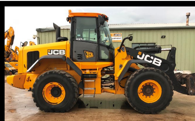
2015 JCB 437 ZX Wheel Loader

Quick attach, Michelin XLD-2 Tyres, climate control. 9,702 hours of use.