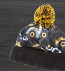
Kids Beanie (JCB2040) - £8.00