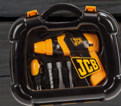
Kids Tool Case (JCB1657) - £10.99