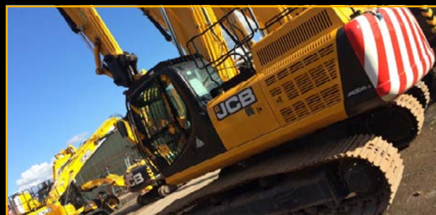
2016 JCB JS300 TRACKED EXCAVATOR £140,000 ex VAT