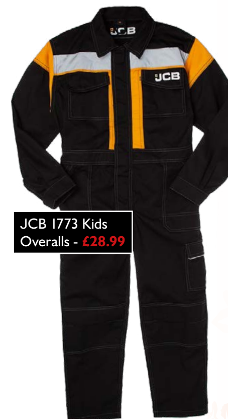
JCB 1773 Kids Overalls - £28.99

Looking for present ideas for the children this Christmas? We have a fantastic selection of JCB merchandise that is bound to delight the young ones. Contact your nearest Gunn JCB depot to place an order.