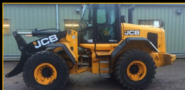
2014 JCB 437ZX WHEELED LOADER £66,000 ex VAT