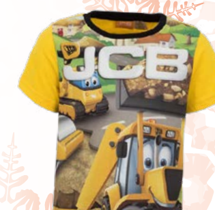
JCB 1958 Boys Short PJ's - £10.00