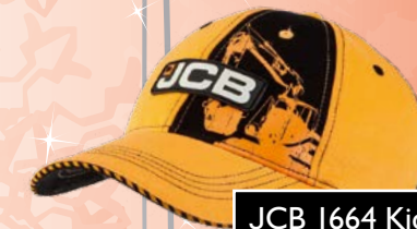
JCB 1664 Kids Cap - £8.99