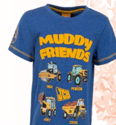
JCB 1909 Muddy Friends Tee - £9.00