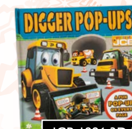
JCB 1896 3D Diggers Book - £8.99