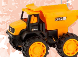
JCB 1653 7" Dumptruck - £4.99