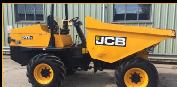
2015 JCB 6T DUMPER £18,250 ex VAT