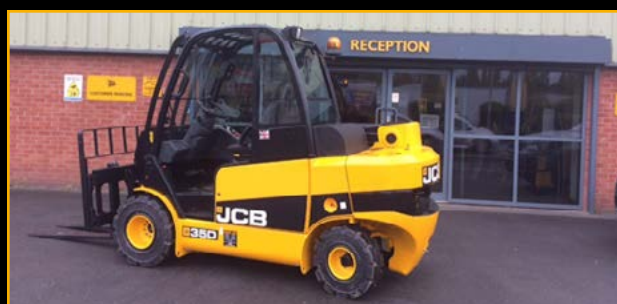
2012 JCB TLT 35D TELETRUK £28,555 ex VAT

Refurbished, partial cabin, forks and side-shift