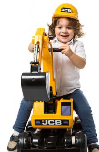
JCB 1893 - Kids Excavator Ride-On - £59.99