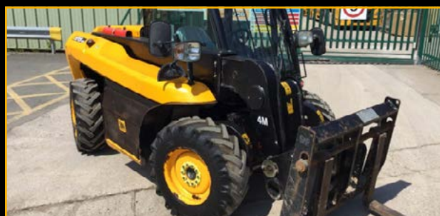
2013 JCB 515-40 TELEHANDLER £22,500 ex VAT