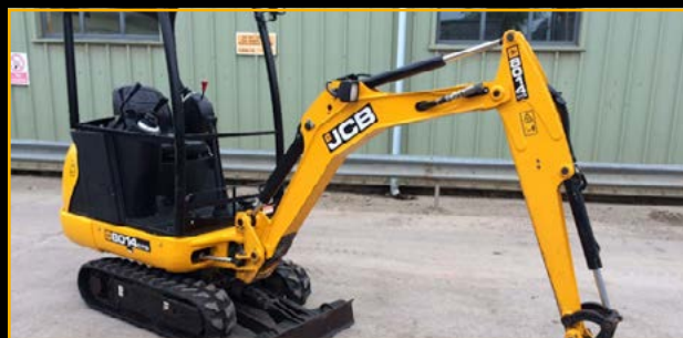
2015 JCB 8014 CTS MINI EXCAVATOR £9,000 ex VAT