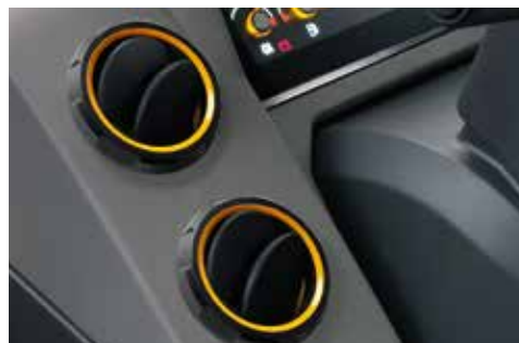
Air conditioning and climate control options.