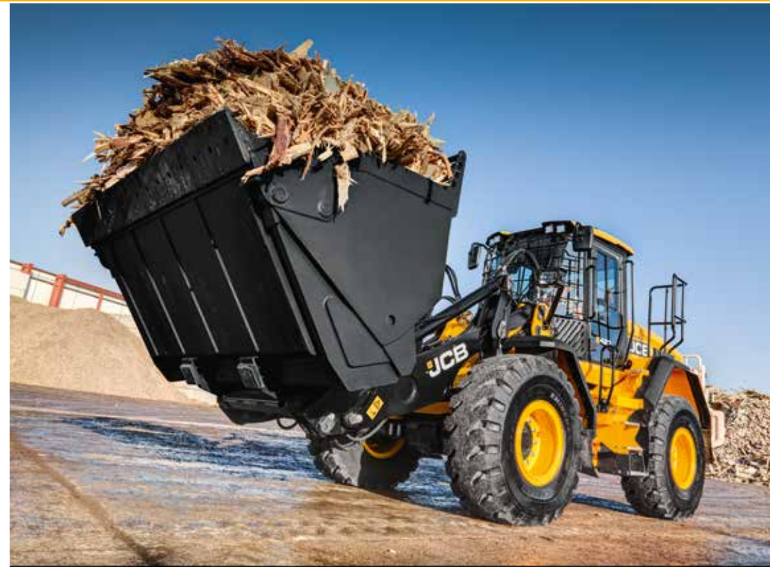
High capacity waste shovel.

FROM BUCKETS, SHOVELS, HYDRAULIC POWERPACKS AND TOOLS, TO SPECIALISED PRODUCTS FOR A HUGE RANGE OF APPLICATIONS LIKE SORTING AND DEMOLITION, OUR GENUINE JCB ATTACHMENTS CAN BE PERFECTLY MATCHED TO ANY MACHINE. THEY'RE BACKED BY OUR WORLDWIDE SERVICE TEAM TOO.