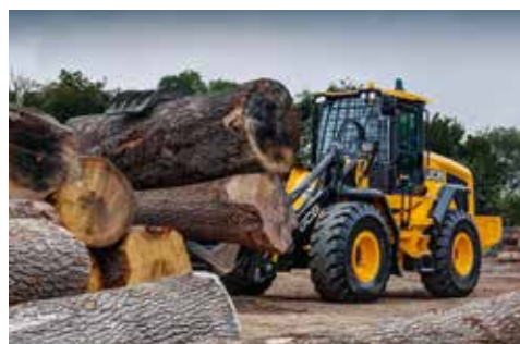
High torque at low rpm.