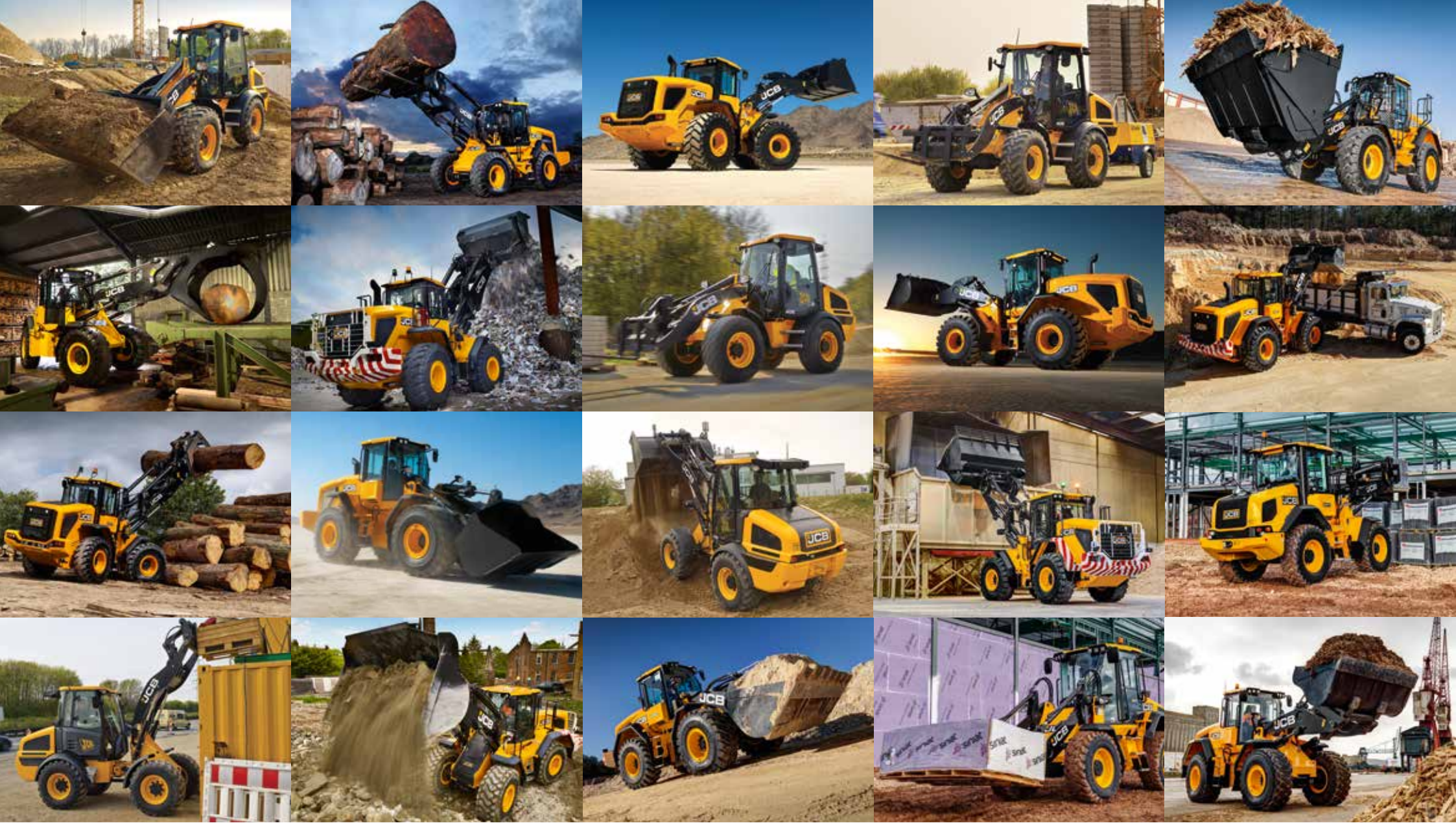
WHEEL LOADER | RANGE