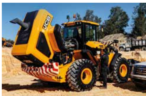
Twin electric actuator, single piece hood.