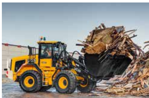
Smoothride option reduces material spillage.