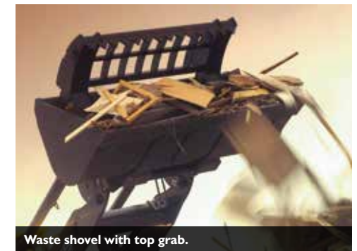
Waste shovel with top grab.