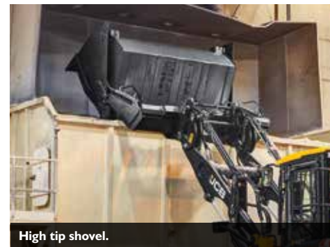
High tip shovel.