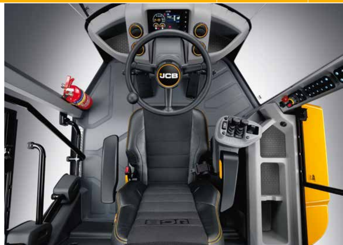
JCB CommandPlus cab with two LCD screens give easy access to operating menus. Adjustable steering column with seat mounted hydraulic controls.