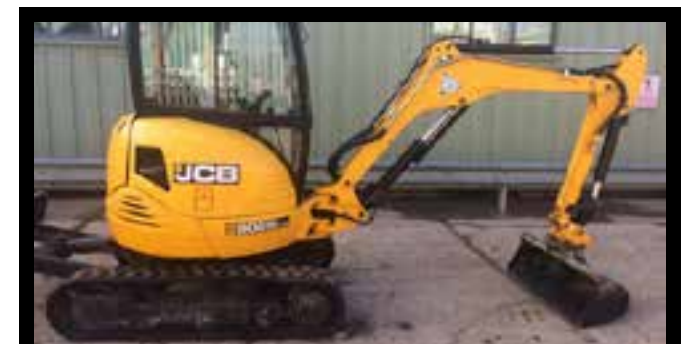
2013 - JCB 8025 ZTS