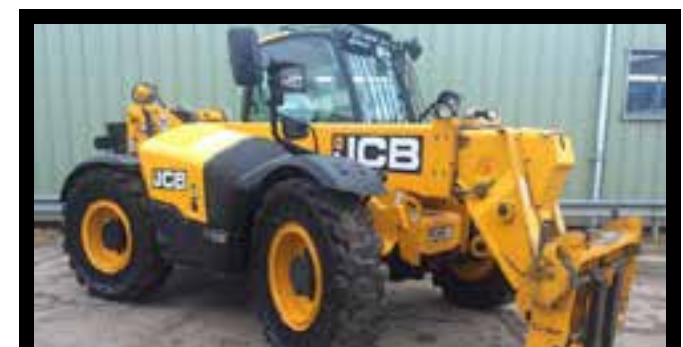
2015 - JCB 550-80 Wastemaster Very tidy Wastemaster spec machine. 3,418 hours of use.