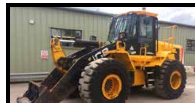
2011 - JCB 456 Wastemaster Wastemaster high lift arms, tyres 90% good, Euro quick hitch. 12,145 hours of use.