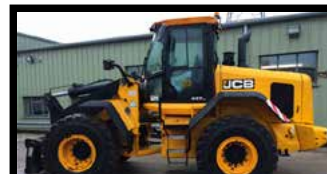
2014 - JCB 437 ZX Hydraulic Euro/Volvo hitch, a/c, reverse camera. 5,666 hours of use.