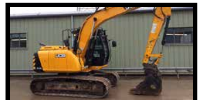
2014 - JCB JS130 LC Hammer pipework, D lock hitch. 5,782 hours of use.