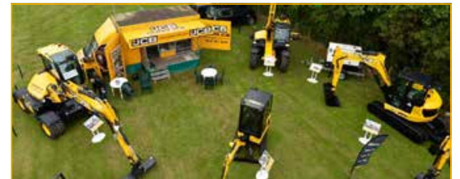
A bird's eye view from the top of our S2632E electric scissor lift.

excavator, 531-70 telescopic handler, BCRY19 generator, the new S2632E electric scissor lift and new 18Z-I mini excavator. The latter generated significant interest, particularly the 180° service door which offers excellent access. Our new S2632E electric scissor lift which flew the Welsh flag could be seen from afar with a maximum platform height of 8.1 metres and attracted attention, with many people enquiring about the current offer on JCB Access platforms.