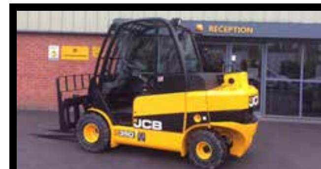
2012 - JCB TLT 35D Refurbished TLT 35D, partial cabin, forks and side-shift. 4,175 hours of use.