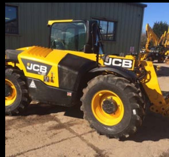
2013 - JCB 526-56 Telehandler POA Manual shuttle transmission, 4WD disconnect, reverse fan, tool carrier carriage with forks, no air con, 2,700 hours use.