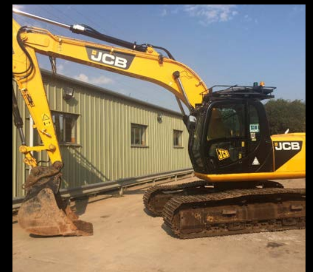
2012 - JCB JS220 LC Excavator POA Hammer pipework, hydraulic double lock hitch, cab guards, 3 buckets, 4,796 hours use.

For more information, call Morgan Aherne on 07740 826189 or email morgan.aherne@gunn-jcb.co.uk