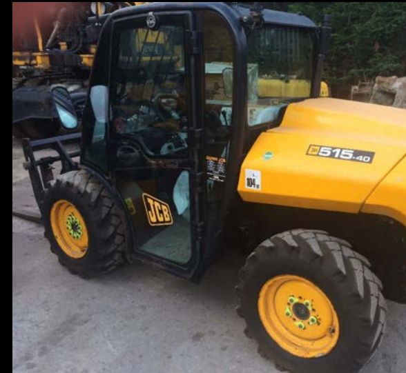
2011 - JCB 515-40 Telehandler £17,500 1,500kg maximum lift capacity, 400cm maximum lift height, 2,063 hours use. ex VAT