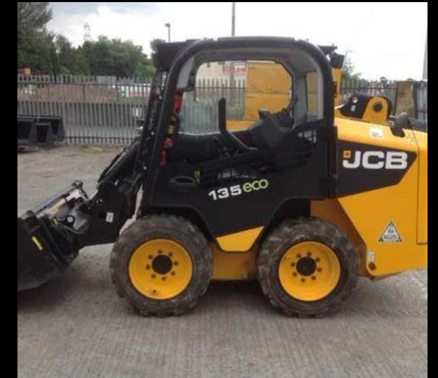
2013 - JCB 135 Skid Steer Loader £19,750 Partial Cab, pneumatic tyres, GP shovel, 271 hours use. ex VAT